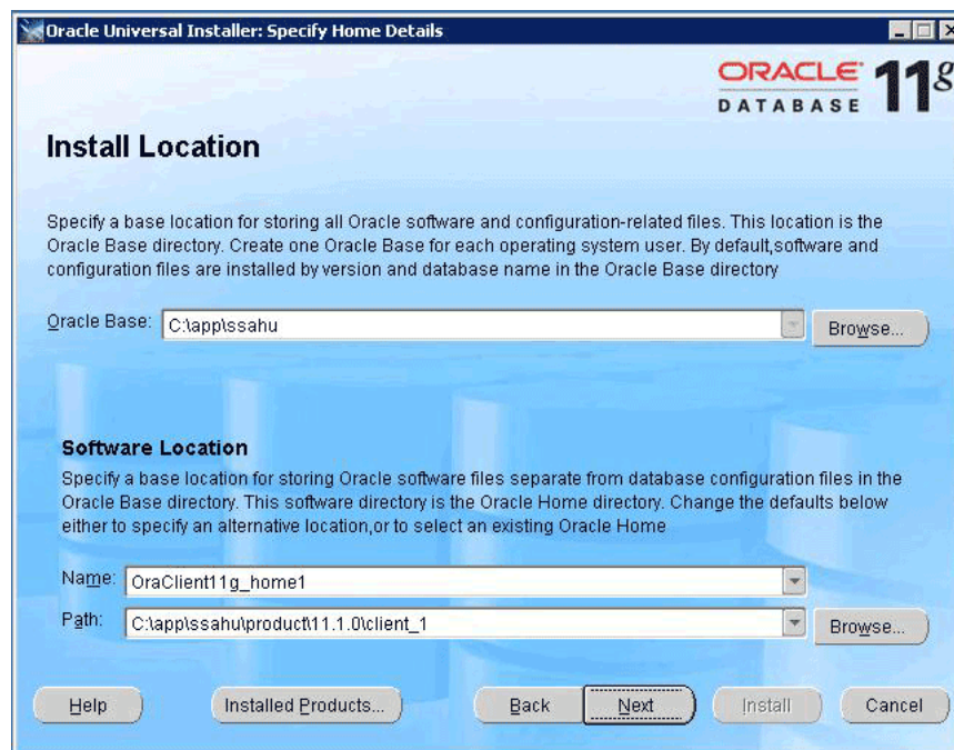
Figure 1-3 Oracle Universal Installer Install Location Screen

The Install Location window appears as shown in Figure 1-3 .