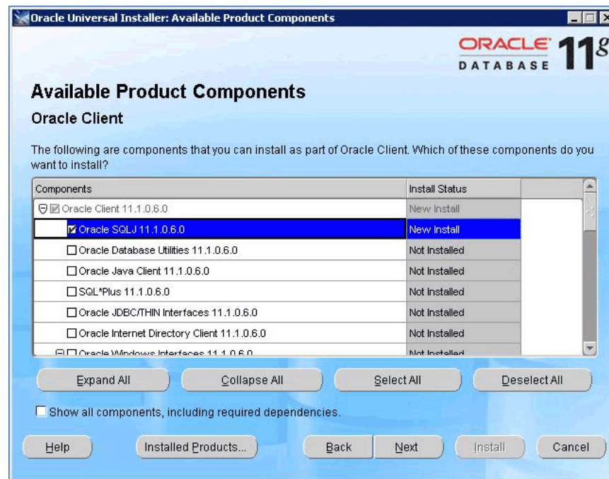
Figure 1–5 Oracle Universal Installer Available Product Components Screen