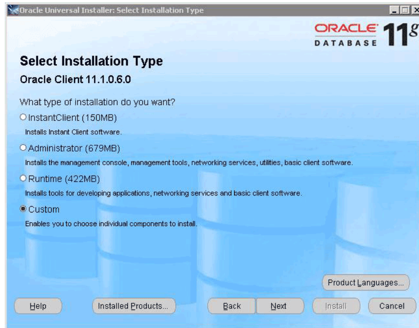
Figure 1-2 Oracle Universal Installer Select Installation Type Screen

The Select Installation Type window appears as shown in Figure 1-2 .