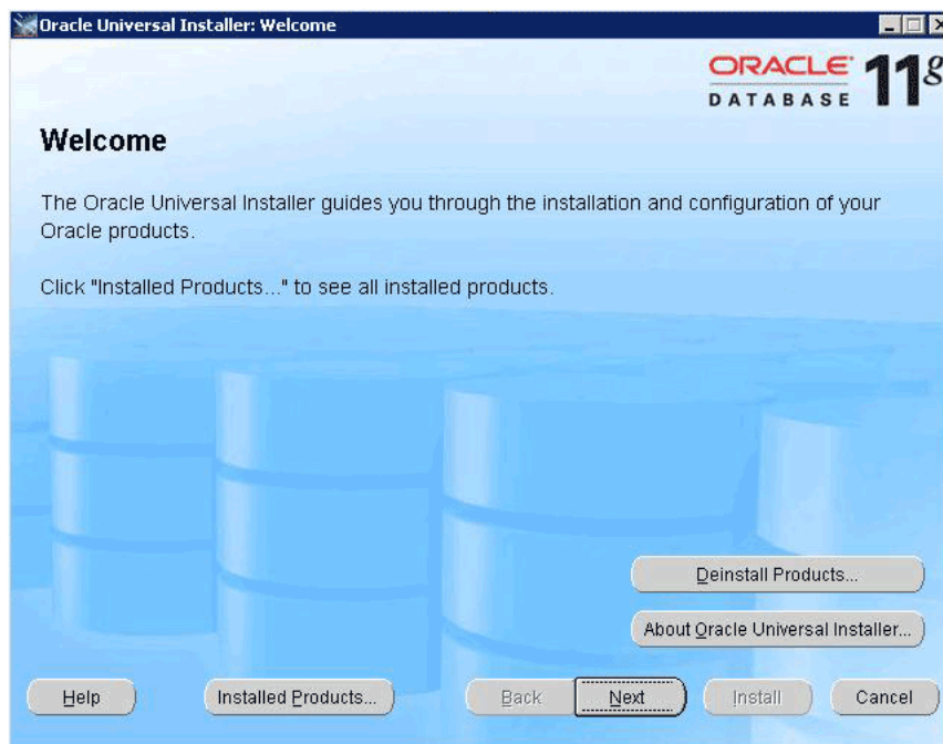
Figure 1-1 Oracle Universal Installer Welcome Screen

The Welcome window appears as shown in Figure 1-8 .