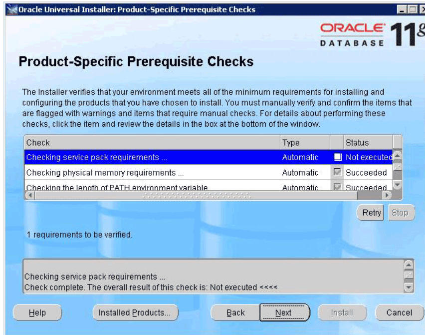
Figure 1-4 Oracle Universal Installer Product-Specific Prerequisite Check Screen