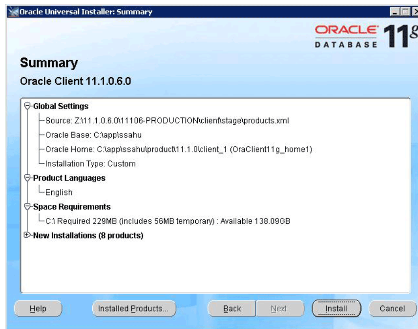
Figure 1–6 Oracle Universal Installer Summary Screen